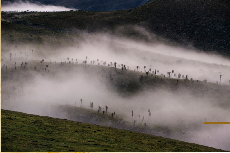
High Andean Ecosystem

Sumapáz, the biggest paramo of the world