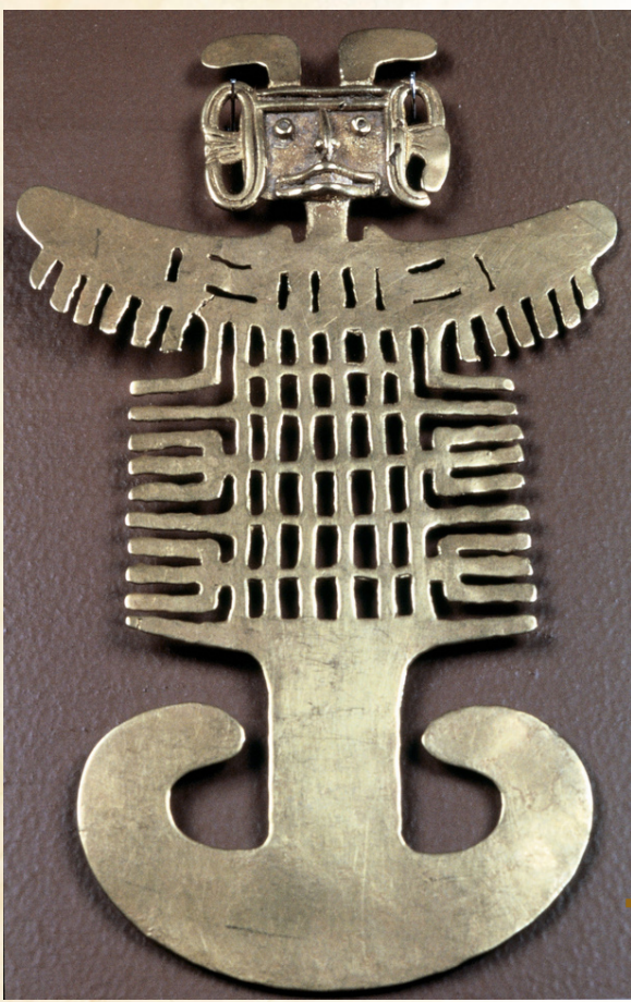
El Dorado, legend Muisca

Bogotá, "La Atenas Suramericana", Capital city of Colombia.