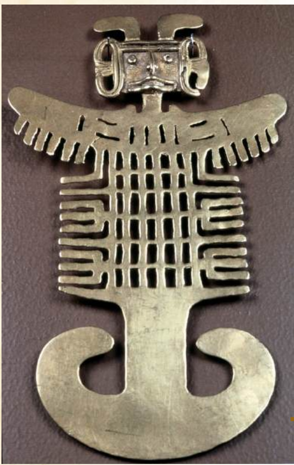
El Dorado, legend Muisca

Bogotá, "La Atenas Suramericana", Capital city of Colombia.