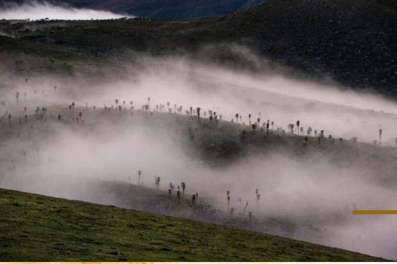
High Andean Ecosystem

Sumapáz, the biggest paramo of the world